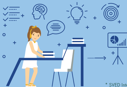
* SVED Intern

In recognizing housing needs in our communities, SVED was the facilitator of the concept to expand housing opportunities in Beloit and coordinated the efforts with the tax credit process, developers and owners of the projects. The Crown Home Project has added 9 well built, attractive and functional homes to the inventory of Beloit. It will benefit many lives over the life of the units, while adding to the tax base of the county and city.